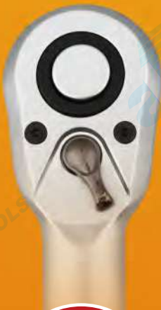
KH3000 Gourd Shape Ratchet Head