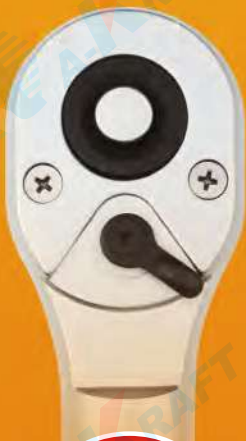
Normal Type B Oval Shape Ratchet Head