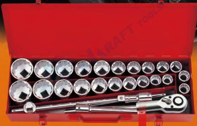
28PC 3/4"DR. Socket Set