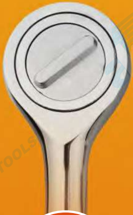
Normal Type A Round Shape Ratchet Head