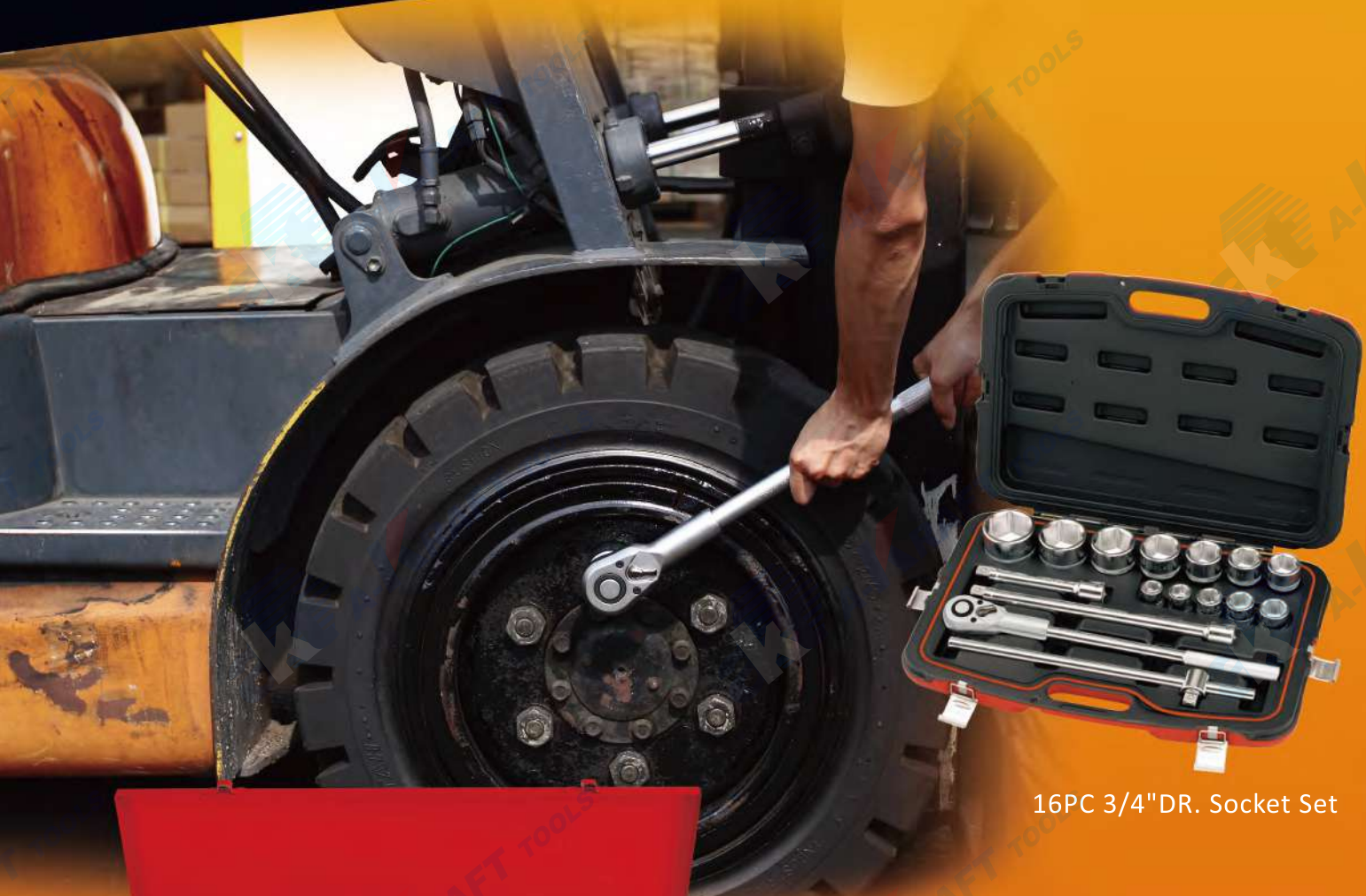
16PC 3/4"DR. Socket Set