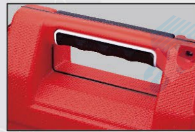
>> Comfortable TPR Handle