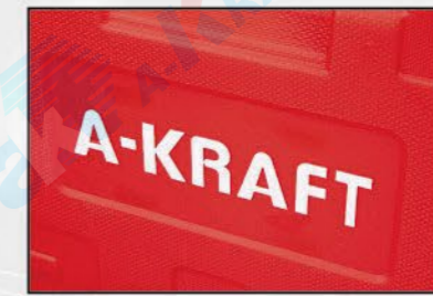
>> Customized Logo