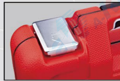
>> Metal Lock