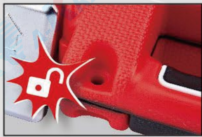
>> Secure Design