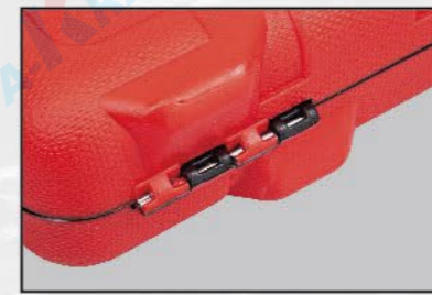
>> Metal Pin Hinge